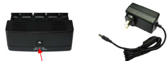
1. Power Jack