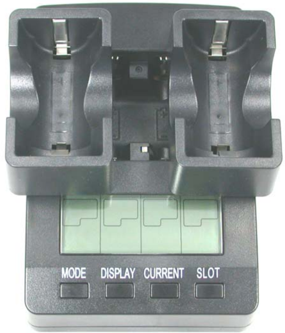
BT-C2000 Charger with C&D Adapters Installed.